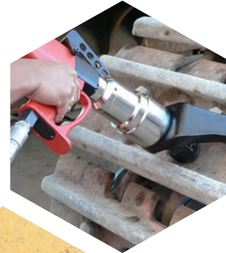
Wheel bolting with Pneutorque® PTM-72