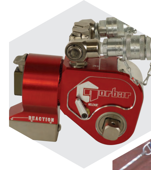
NSD Hydraulic Torque Wrench