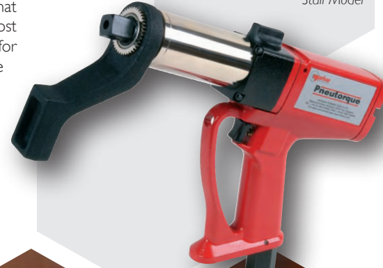
Pneutorque® PTM-52 Series Stall Model

The combination of speed, lightness, low noise, reduced vibration and torque control makes Pneutorque® wrenches ideal for many non-bolting applications. Of these applications, it is in the field of valve actuation and valve grinding in the alumina refining industry that Pneutorques® have so far had the biggest impact. Two speed tools have proved the most popular as they provide rapid opening and closing of the valve together with high torque for grinding the caustic deposit that accumulates on the valve seat. However, it is not just in the alumina refining industry that Pneutorques® are used for valve actuation. The actuation of water valves and gas valves are now common applications.