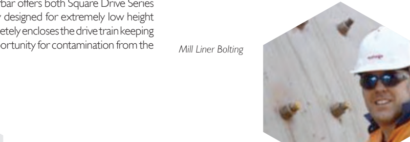
Mill Liner Bolting