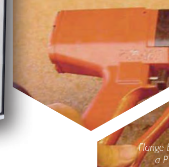
Flange bolting with a PTM-52