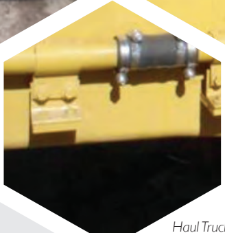
Haul Truck Assembly