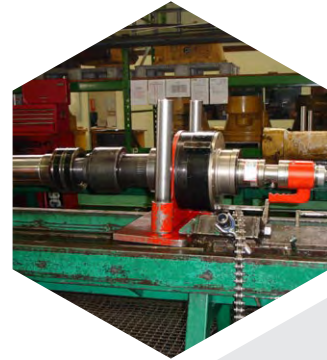
Hydraulic Ram Bench

Keeping hydraulic equipment maintained in good working order is fundamental to the smooth running of any mine site. Pneutorque® pneumatic wrenches have proved outstanding in the application of releasing and re-tightening the gland nut on the rod assembly of hydraulic cylinders. On the largest equipment, the gland nut release torque is sometimes in excess of 100,000 N.m and this fact has resulted in the development of Norbar's largest Pneutorque®, the 300,000 N.m output PT15.