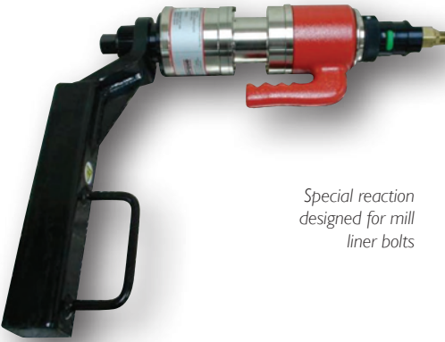
Special reaction designed for mill liner bolts

Flange bolting is another application where Pneutorques® can demonstrate their outstanding combination of accurate torque control but with low noise and vibration. However, for low height applications hydraulic torque wrenches will often be the preferred method of bolting. Norbar offers both Square Drive Series "NSD" and Hex Link Series "NHCL" hydraulic wrenches, specifically designed for extremely low height access applications. Our robust and lightweight aluminium body completely encloses the drive train keeping the crucial lubricant inside the tool while significantly reducing the opportunity for contamination from the outside elements.