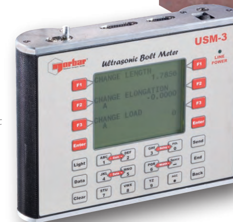
USM-3 Ultrasonic Bolt Meter